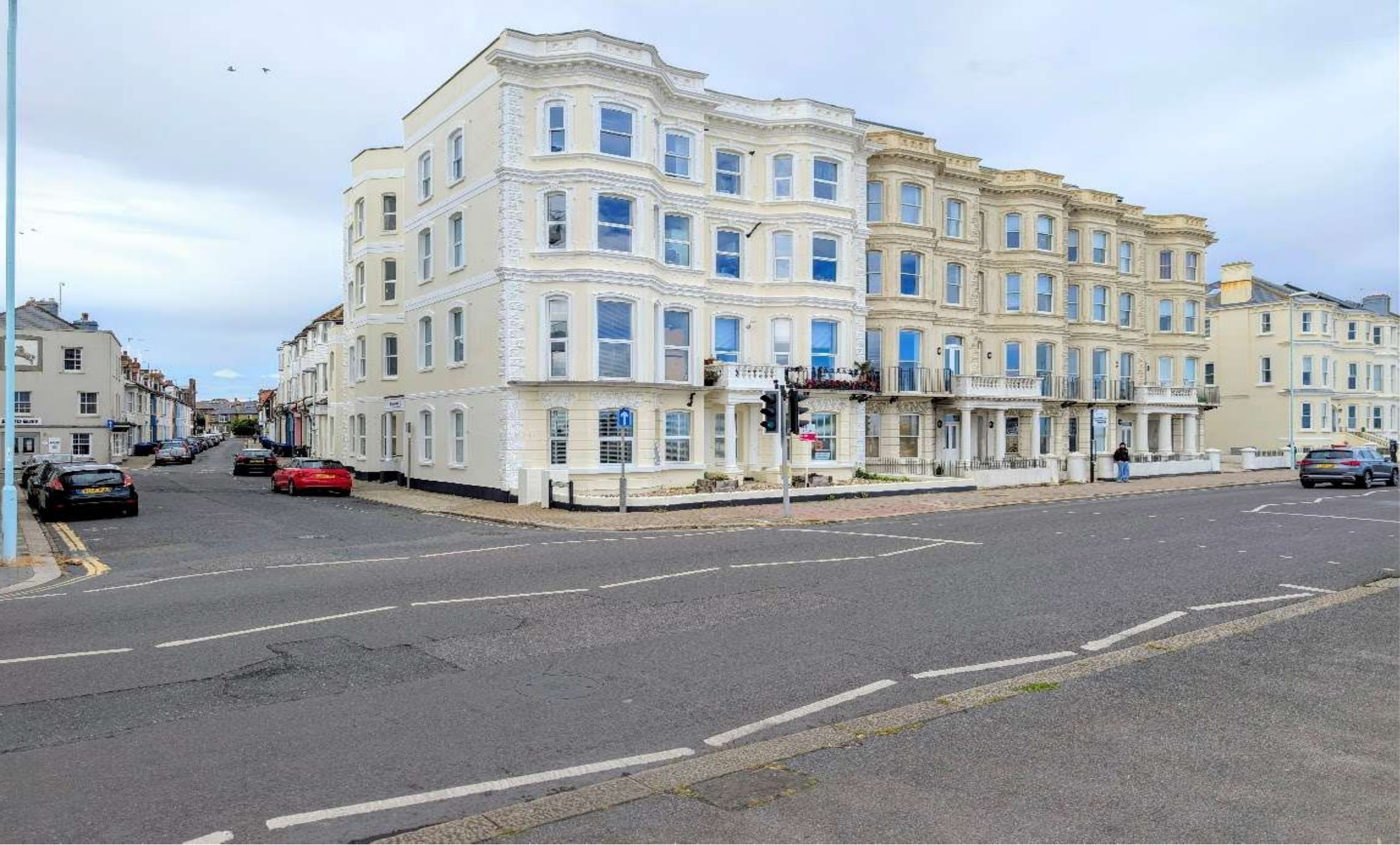
Beachview Marine Parade, Worthing BN11 3SA