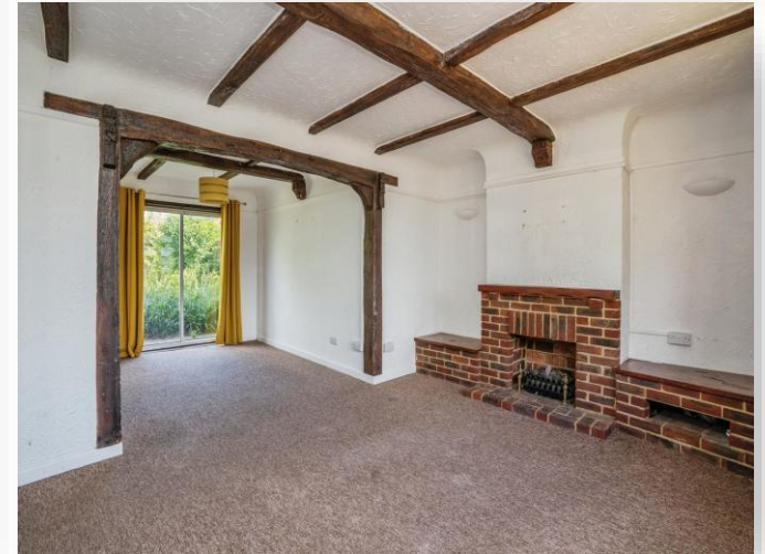
Fitzwygram Crescent, Havant PO9 2BZ