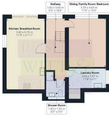
Floor -1 Building 1