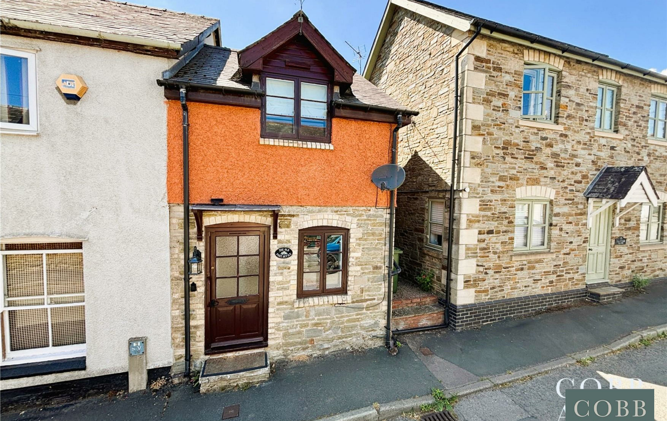
The Old Post Office, Watling Street, Leintwardine, SY7 0LW Price £175,000