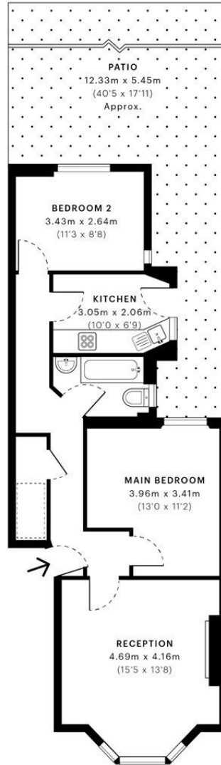
— Ground Floor