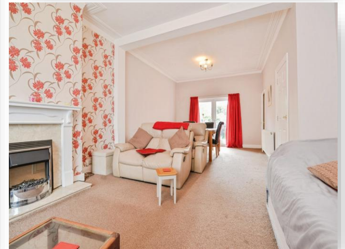
Stanhope Road, Stockton-On-Tees TS18 4LS