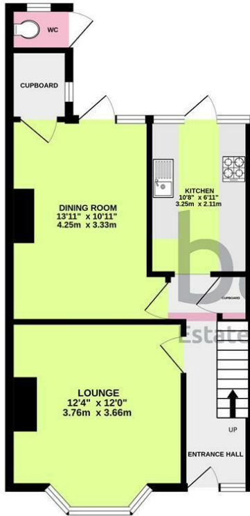
GROUND FLOOR 449 sq.ft. (41.7 sq.m.) approx.