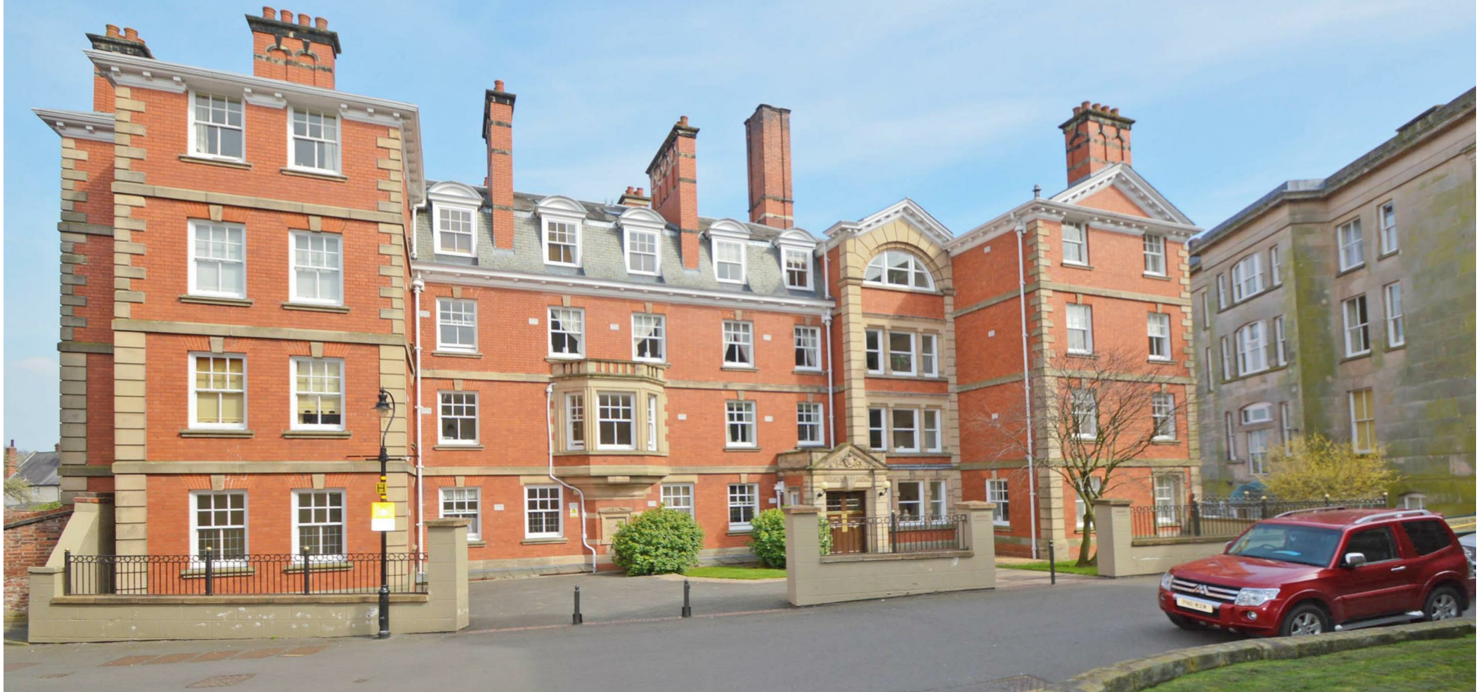
6, Watergate Mansions, St Marys Place, Shrewsbury, SY1 1DW £750 Per Month