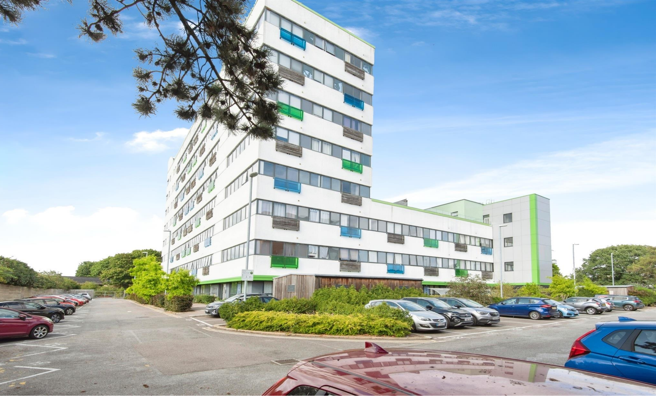
Six Hills House, Kings Road, Stevenage, SG1 1AW