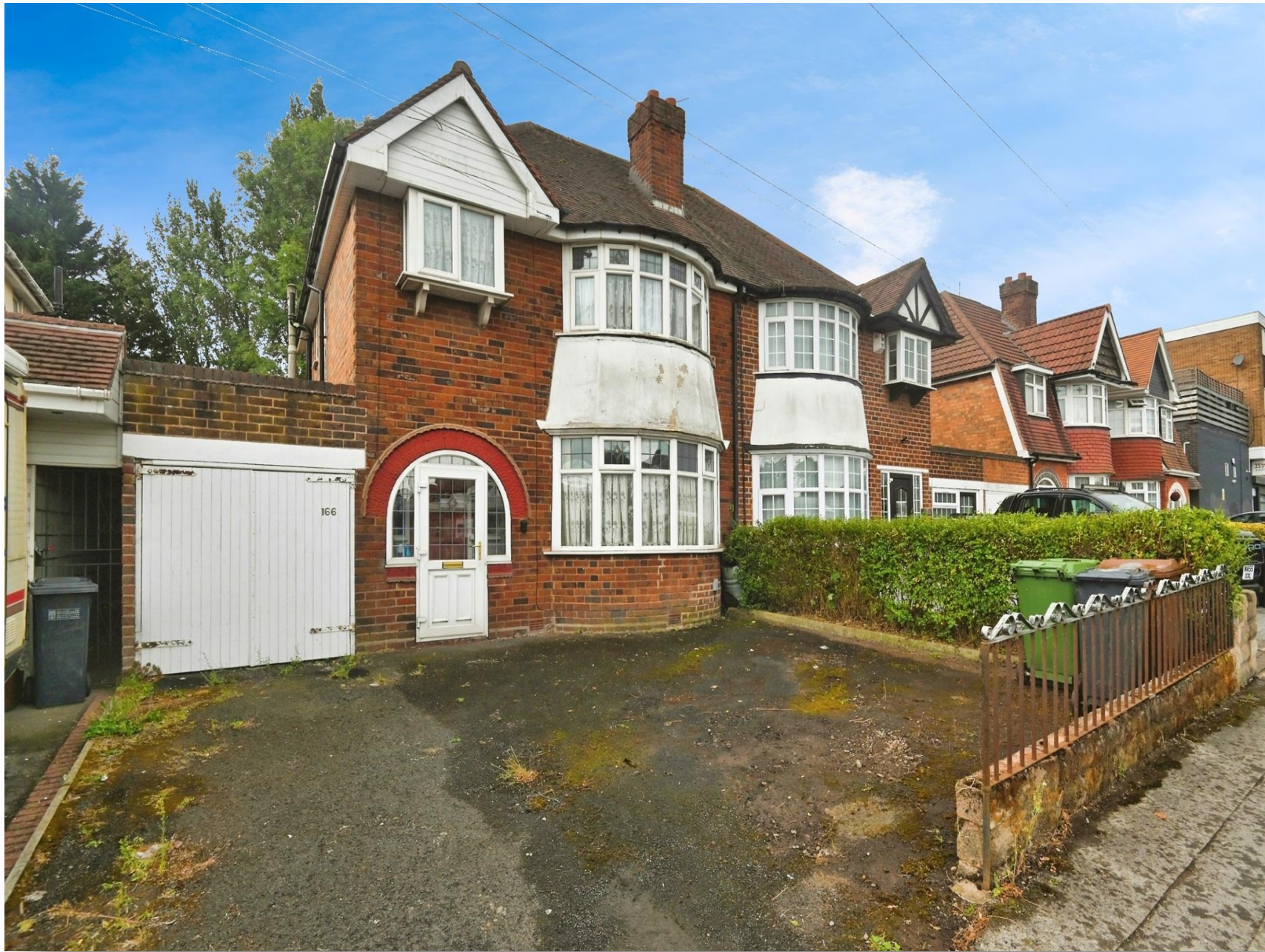
Chester Road, Castle Bromwich Birmingham B36 0JE