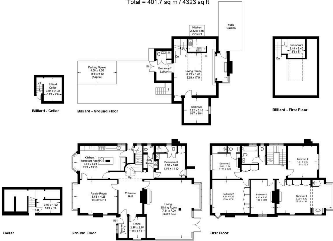
Illustration for identification purposes only, measurements are approximate, not to scale. Fourlabs.co © (ID1280711)