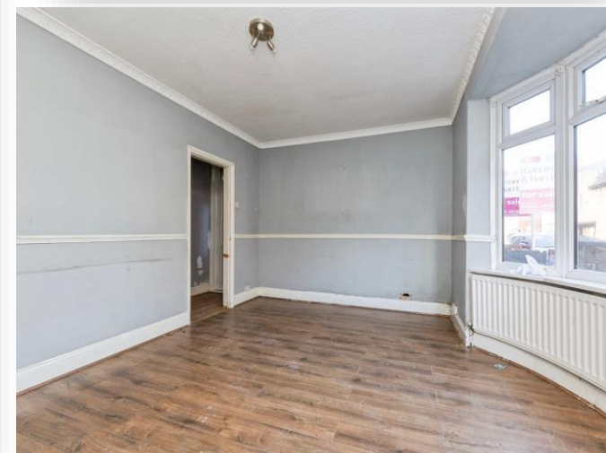
Barton Avenue, Hartlepool TS25 5AN