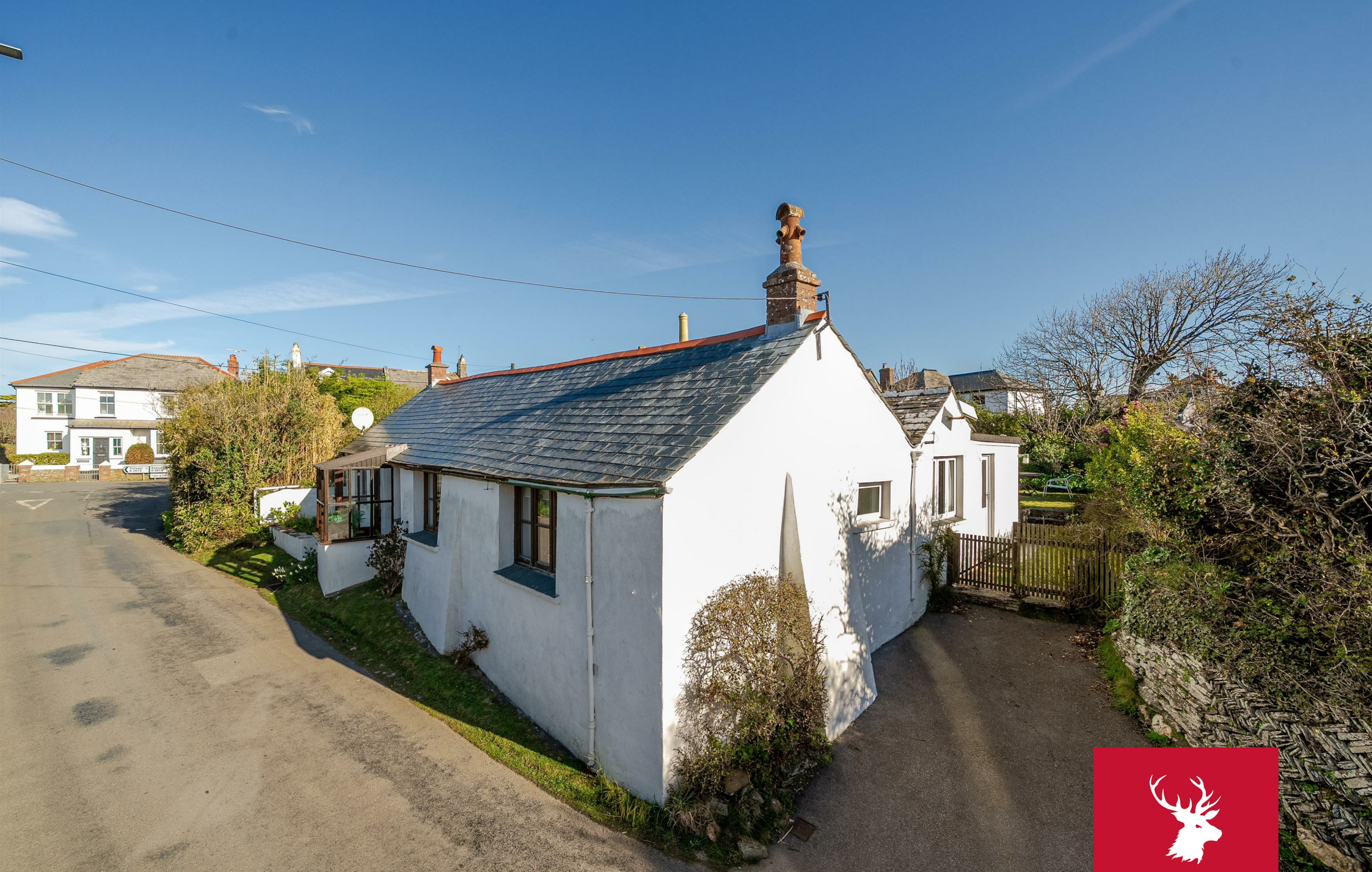
The Old Forge