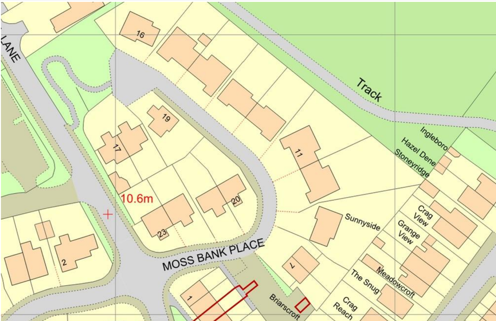
Ordnance Survey 01245747