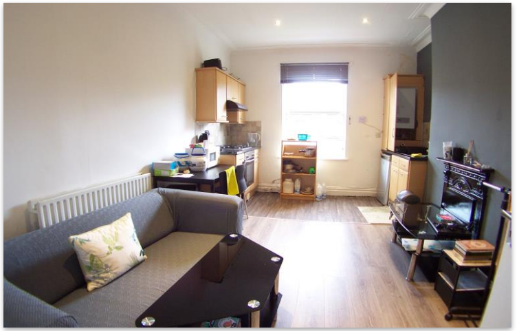
Flat 3, 9, Inglewood Terrace, Delph Lane, Woodhouse, LS6 2HT