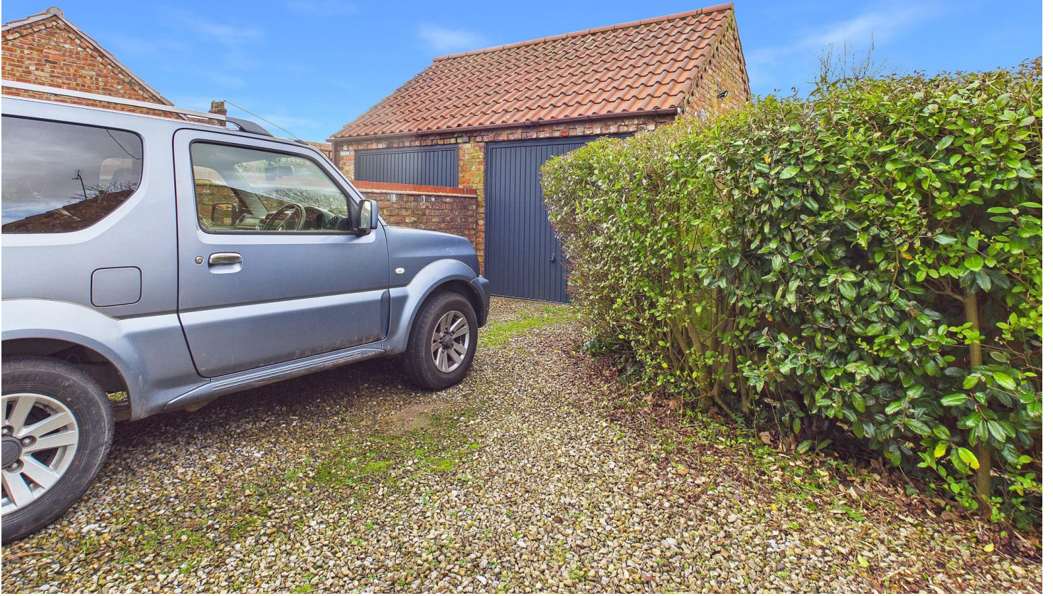
Garage and off-road parking