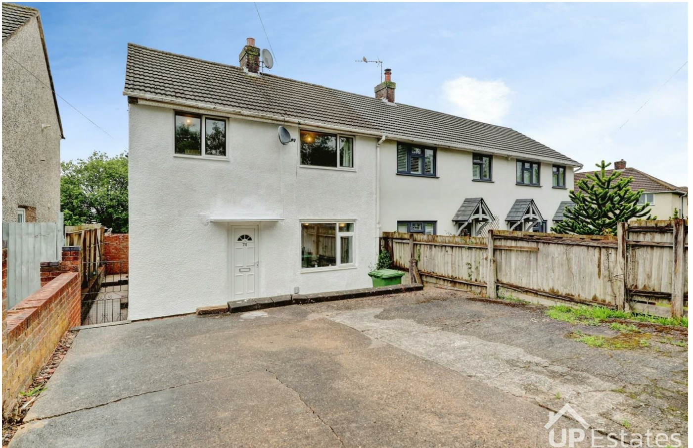
Exhall Road, Keresley End, Coventry