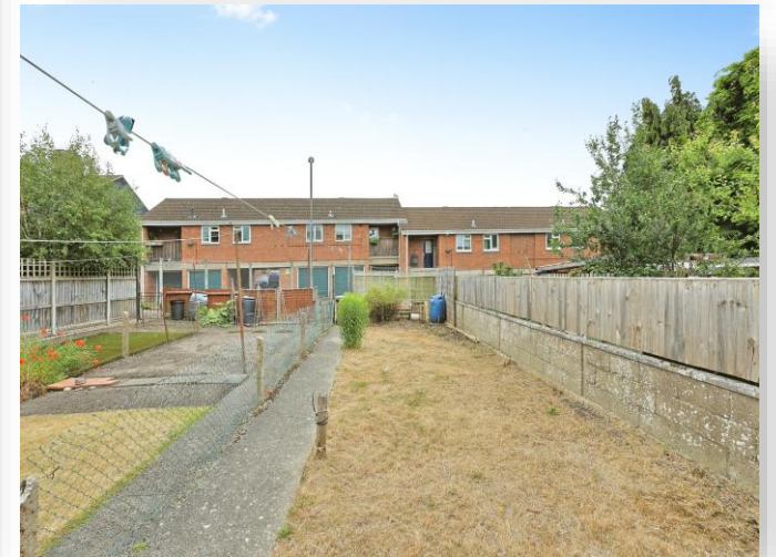
Albany Road, Norwich, NR3 1EE