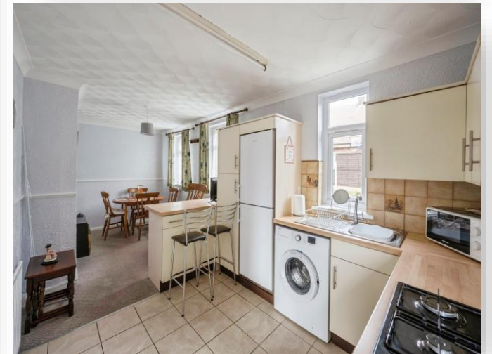
Laburnum Grove, Conisbrough Doncaster DN12 2JW