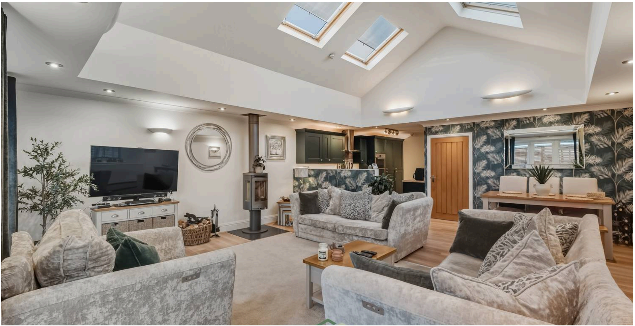
Apt 4, Chester House, 47 Wellington Road Bromsgrove