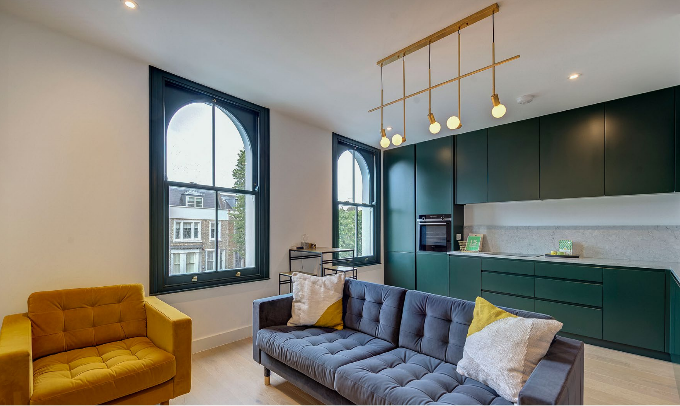
Blenheim Crescent, W11