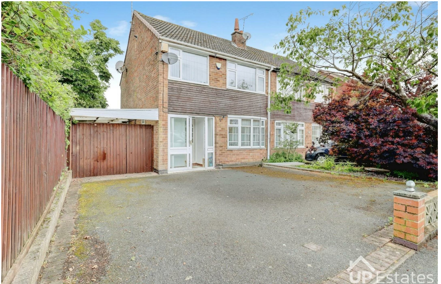
Oxendon Way, Binley, Coventry