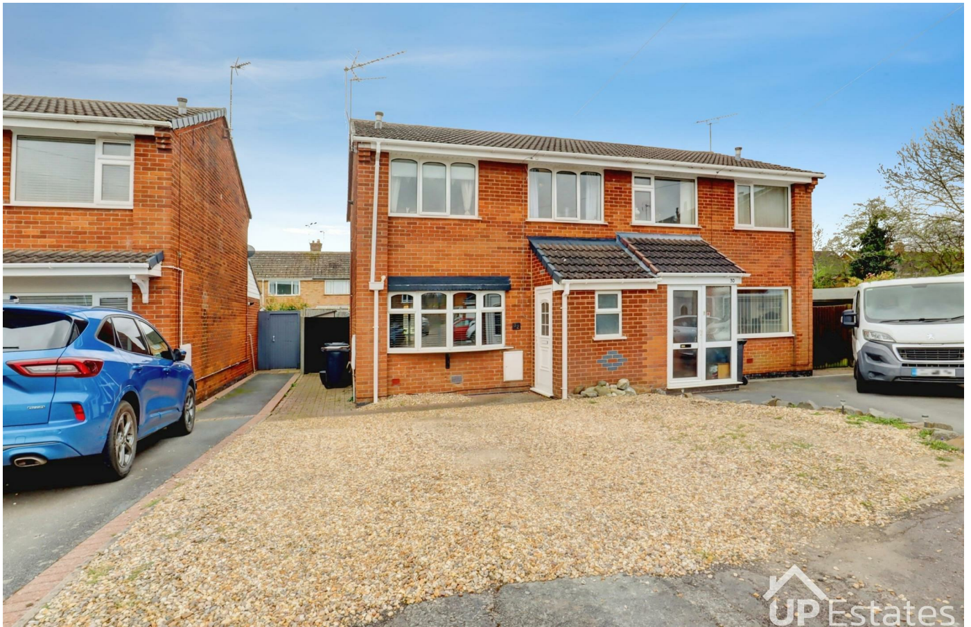
Burnaby Close, Nuneaton