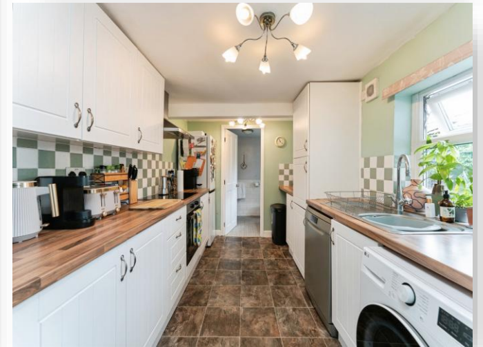
New Street, Doddington PE15 0SP