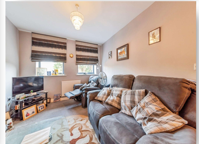
Apartment 12 Mill Gate Apartments Mill Gate, Newark NG24 4TR