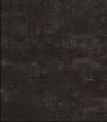
Carbon Steel worktop