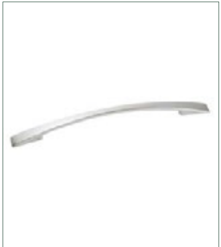
Nickel bow handle HPK953