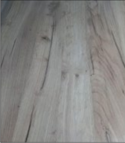
Farmhouse Oak worktop