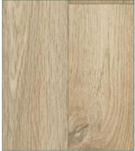
Lassen AA708 vinyl flooring