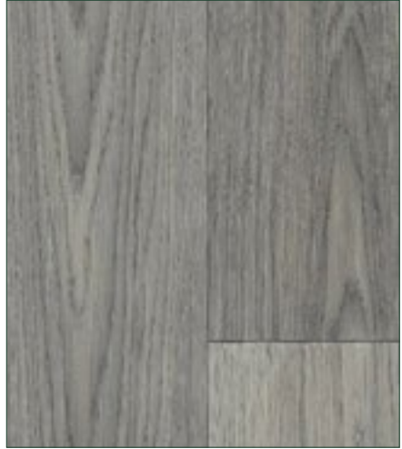
Sabine AA710 vinyl flooring