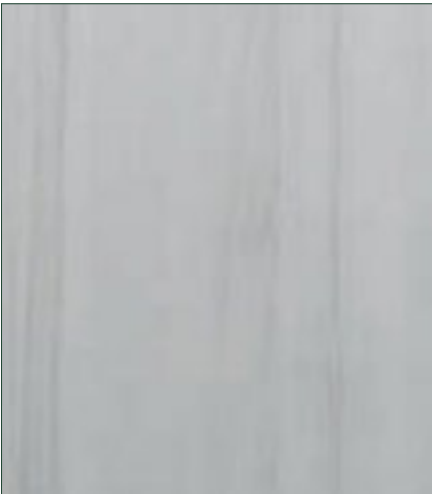
Light driftwood range