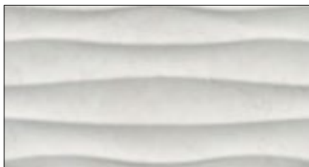
Marbles versus cream décor tiles