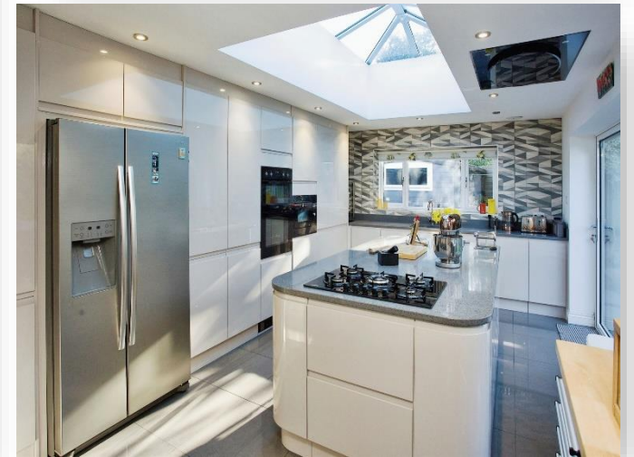
Diana Close, Gosport PO12 2RJ