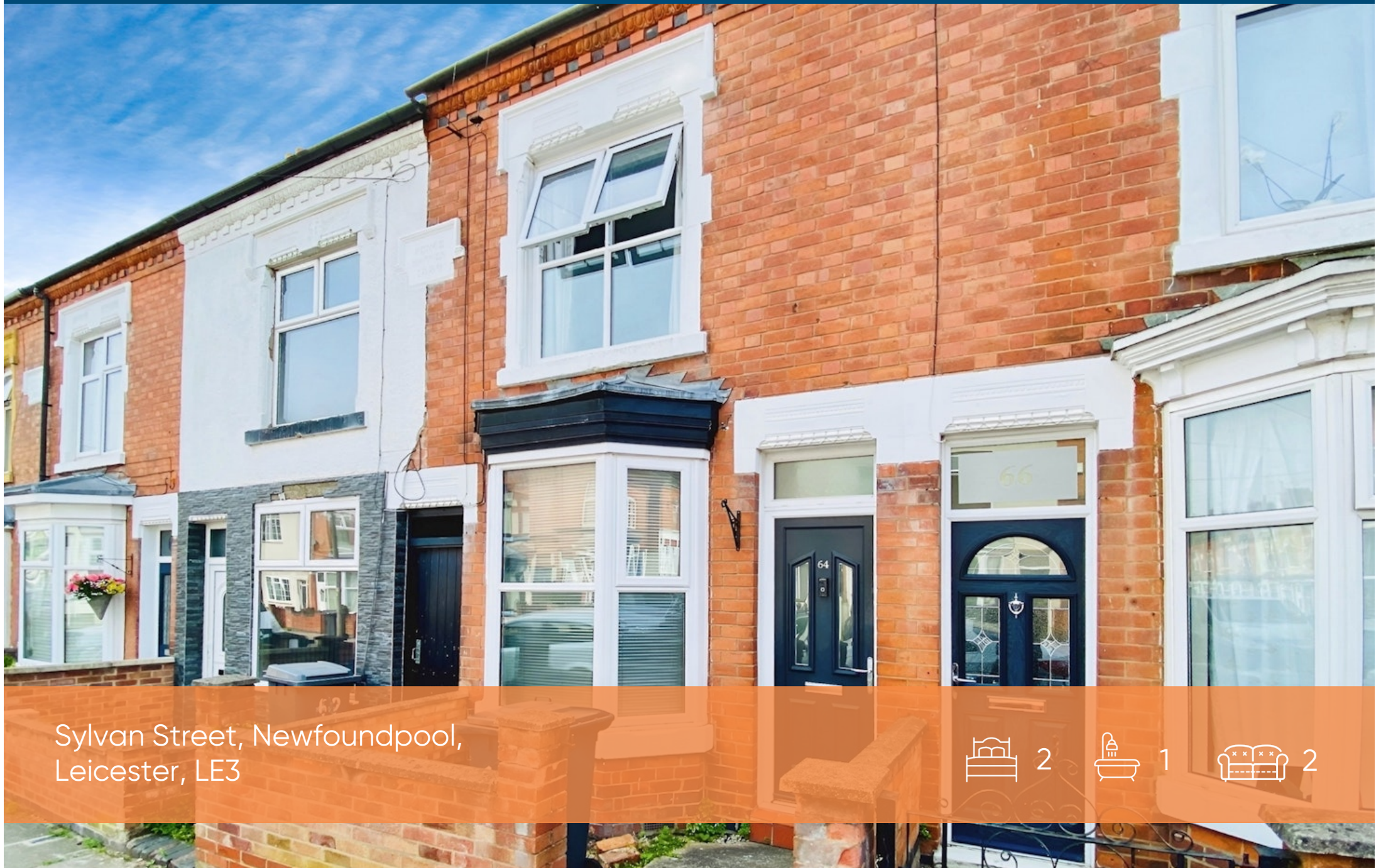
Sylvan Street, Newfoundpool, Leicester, LE3