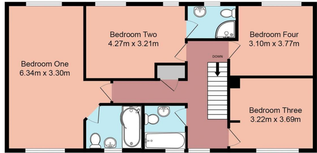
1st Floor 80.8 sq.m. approx.