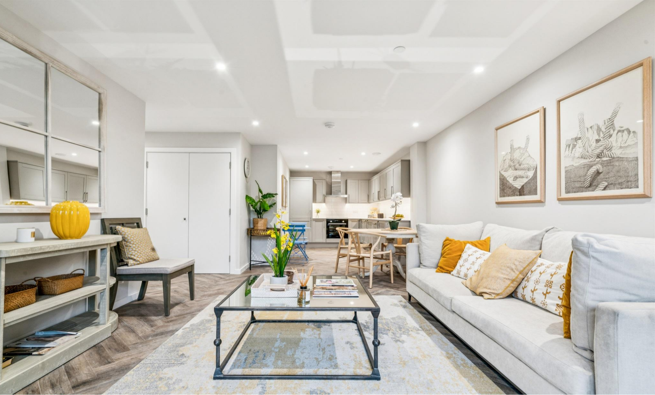
Meadow House Fallsbrook Road, London SW16 6DY