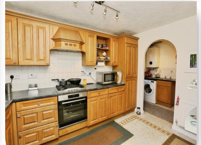
Admiralty Close, Gosport PO12 4GP