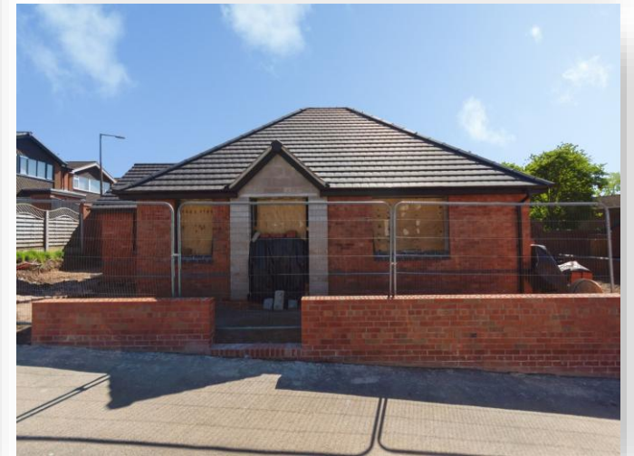
Knottsall Lane, Oldbury B68 9LG