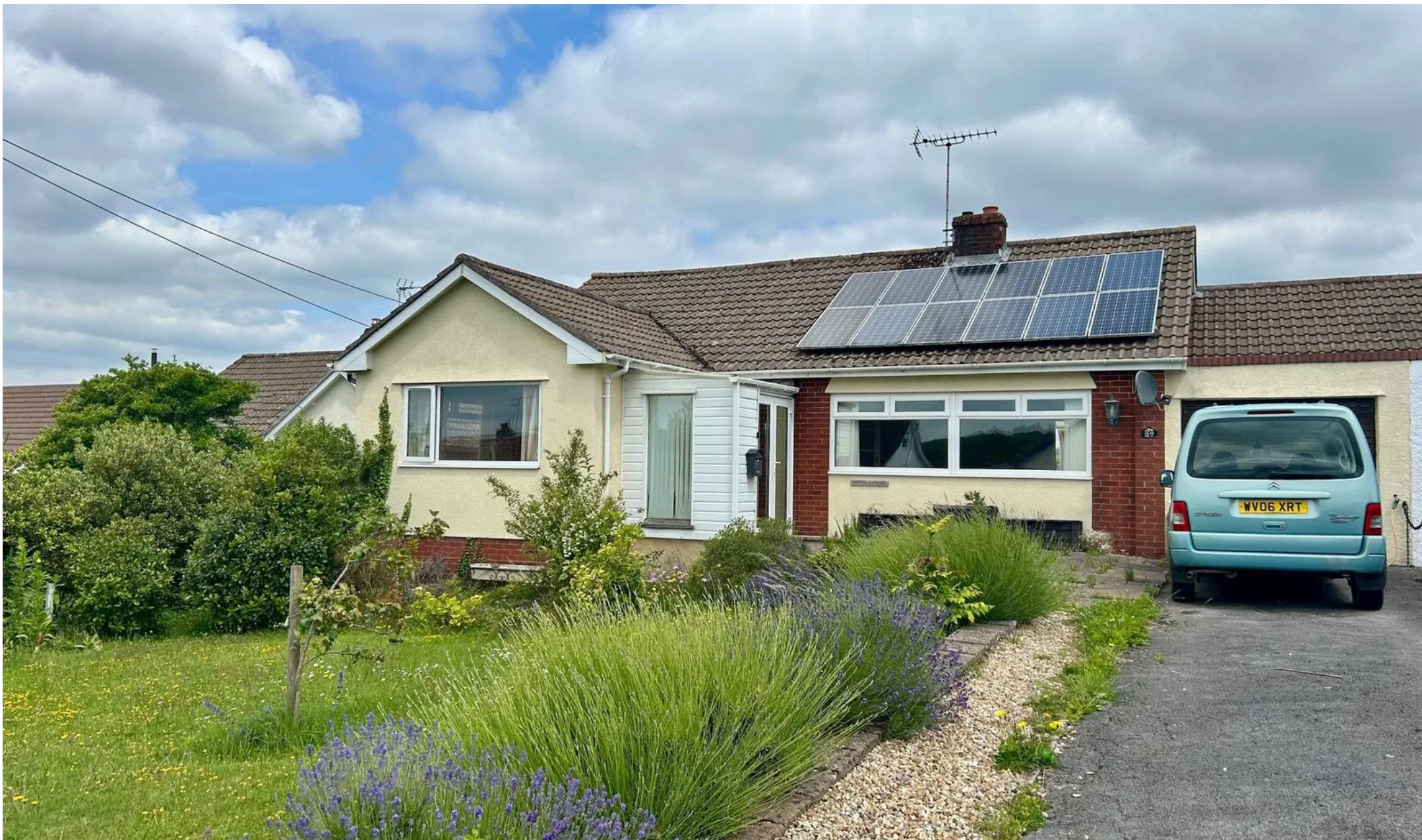
Beech road, Shipham £430,000