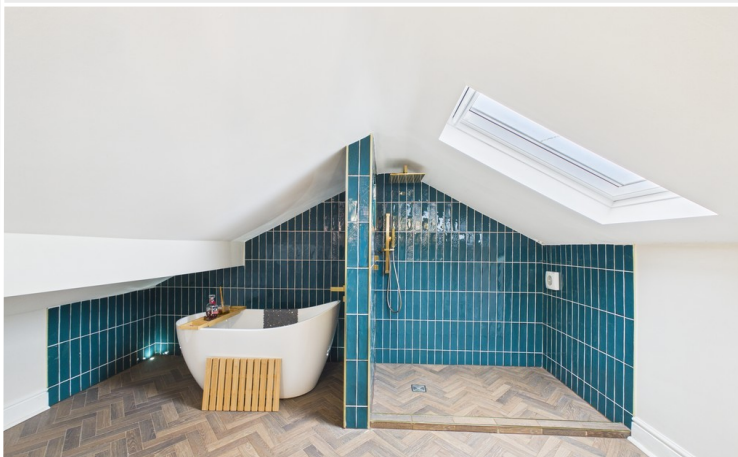
First Floor Bathroom