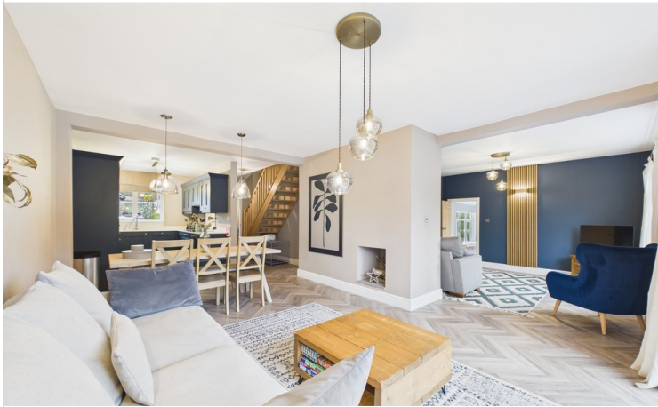
Open Plan Living Space