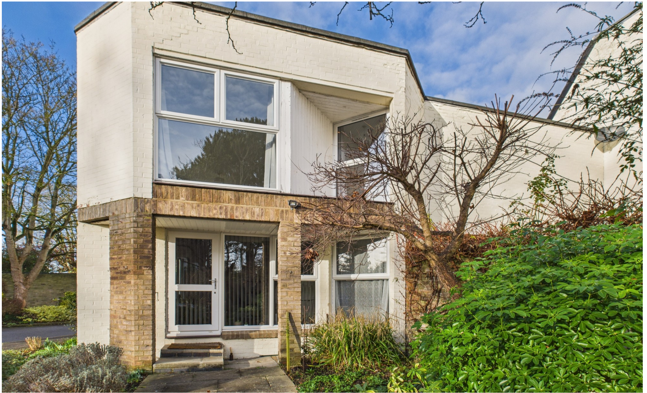
Archway Court, Cambridge CB3 9LW