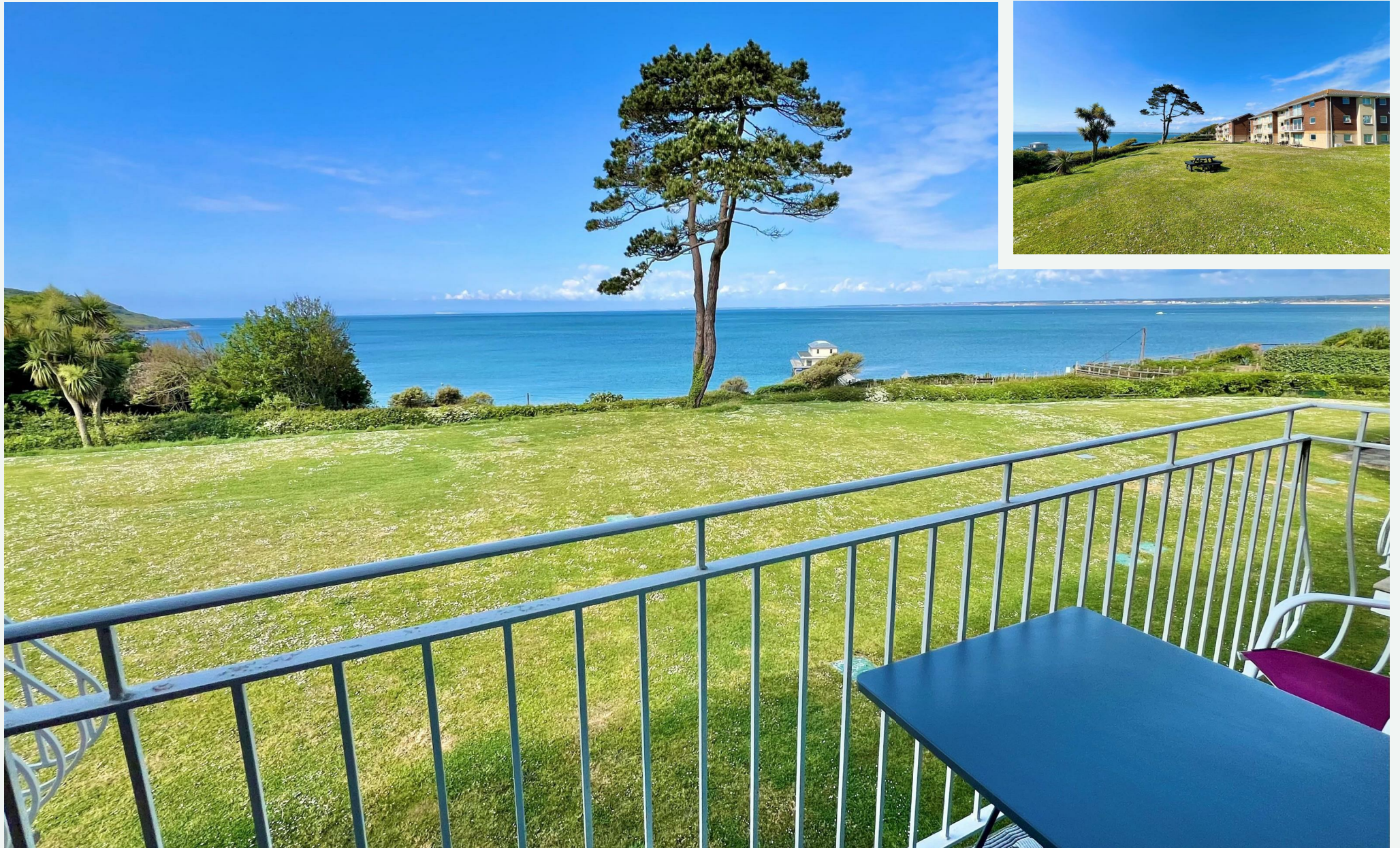
4 Aman Court, Granville Road, Totland Bay, Isle of Wight