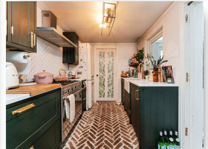
Abbey Road, CAMBRIDGE CB5 8HH