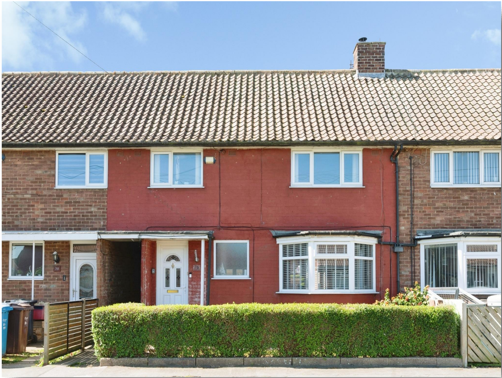
Caledon Close, Hull, HU9 4EG