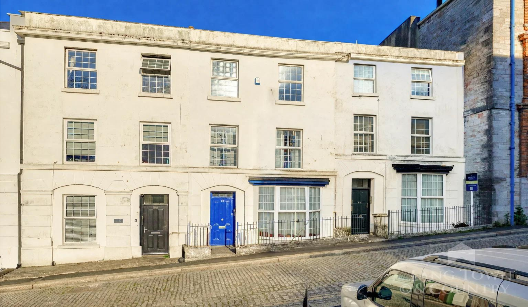
Flat 3, 22 Hoe Street, The Hoe, Plymouth, Devon, PL1 2JA