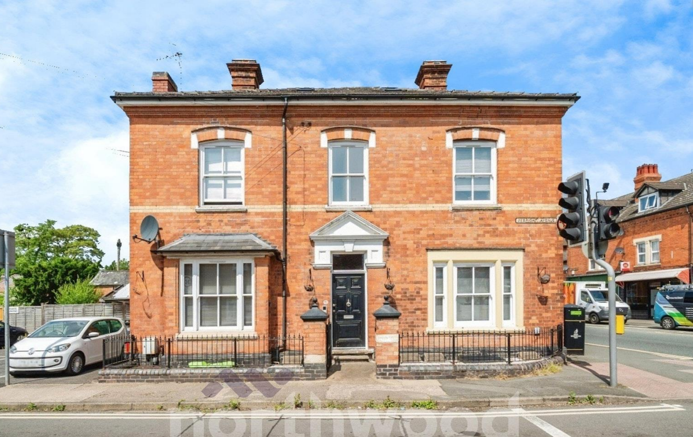
Willersley House, 2 Sebright Avenue, Worcester