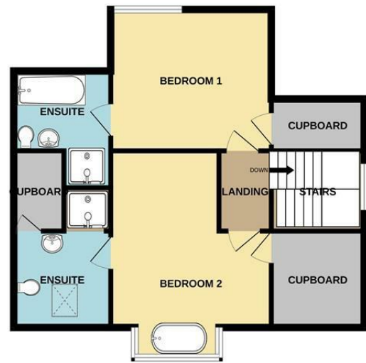
1ST FLOOR 624 sq.ft. (58.0 sq.m.) approx.