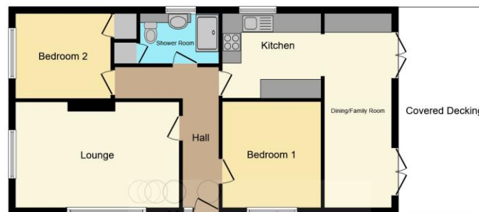
william brown Floor Plan

Double glazed french doors to the front and window to the side.