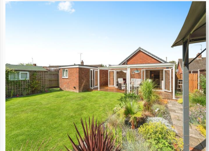
Tammas The Street, Little Snoring Fakenham NR21 0HU