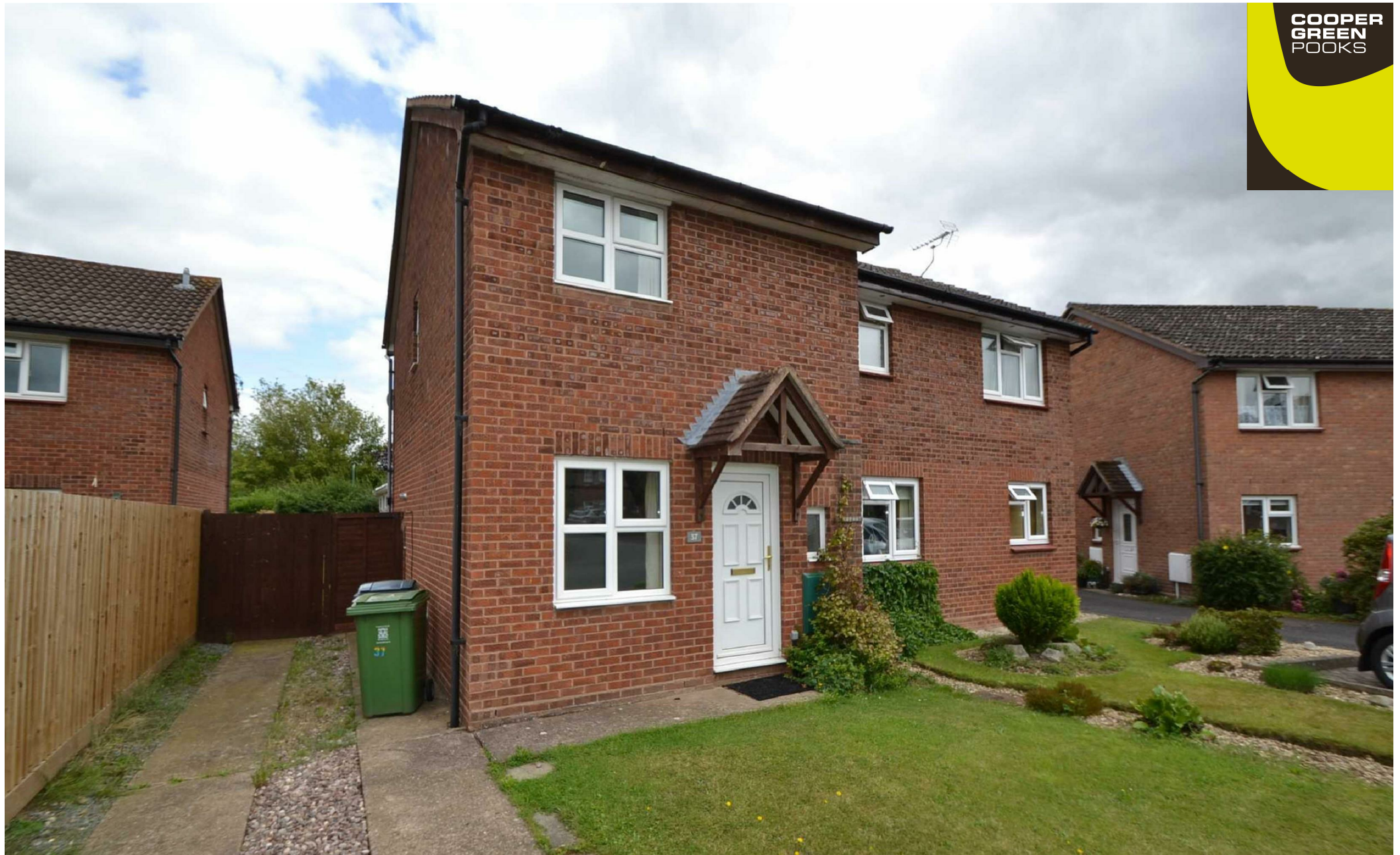
37, Ladycroft Close, Radbrook, Shrewsbury, SY3 6BB £800 Per Month