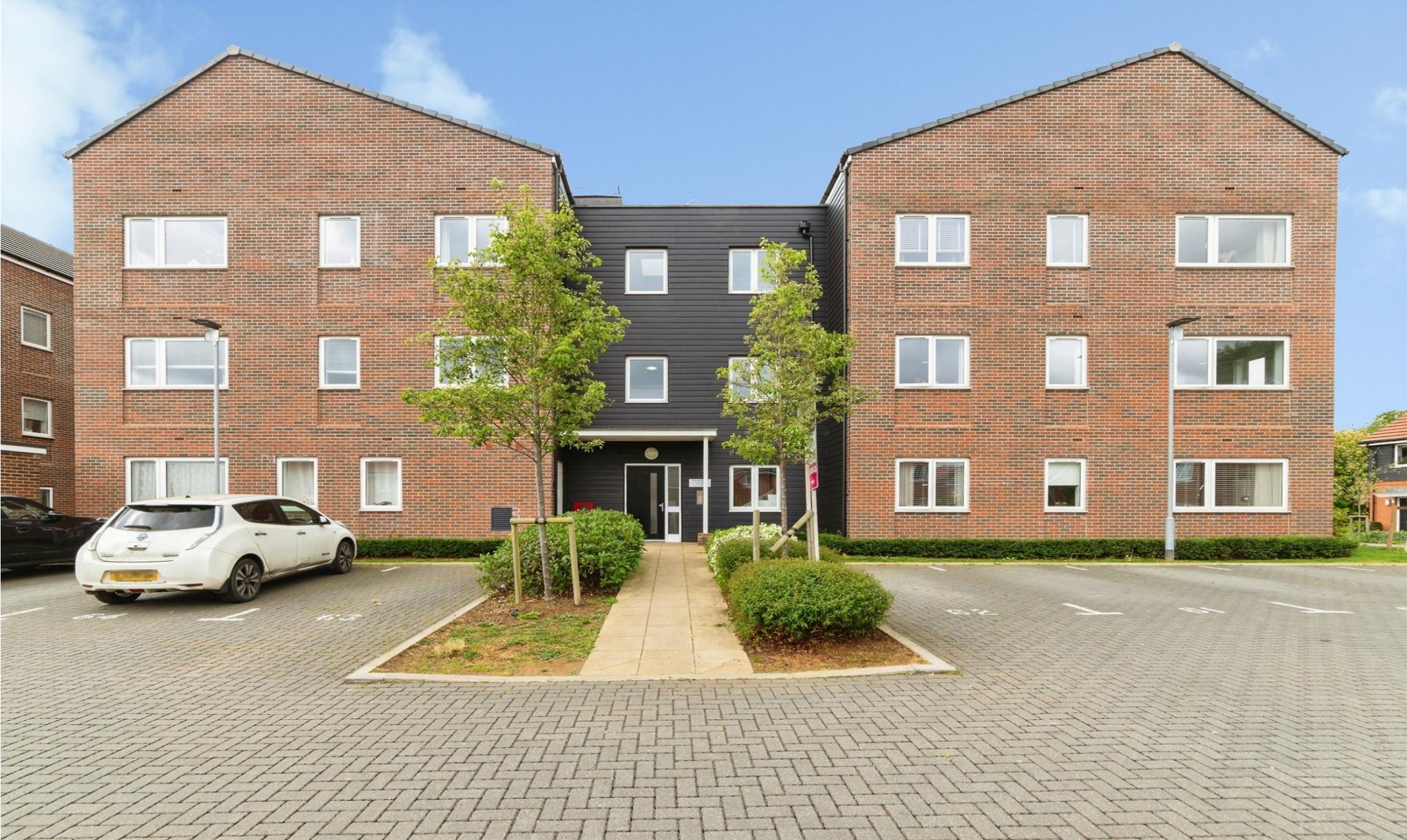
Bramley House Blossom Drive, Welwyn Garden City AL7 1WQ