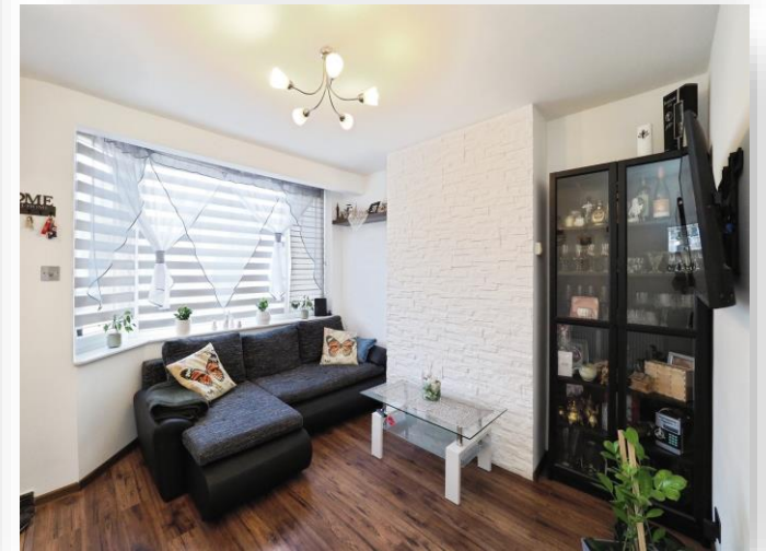
Bottleacre Lane, Loughborough