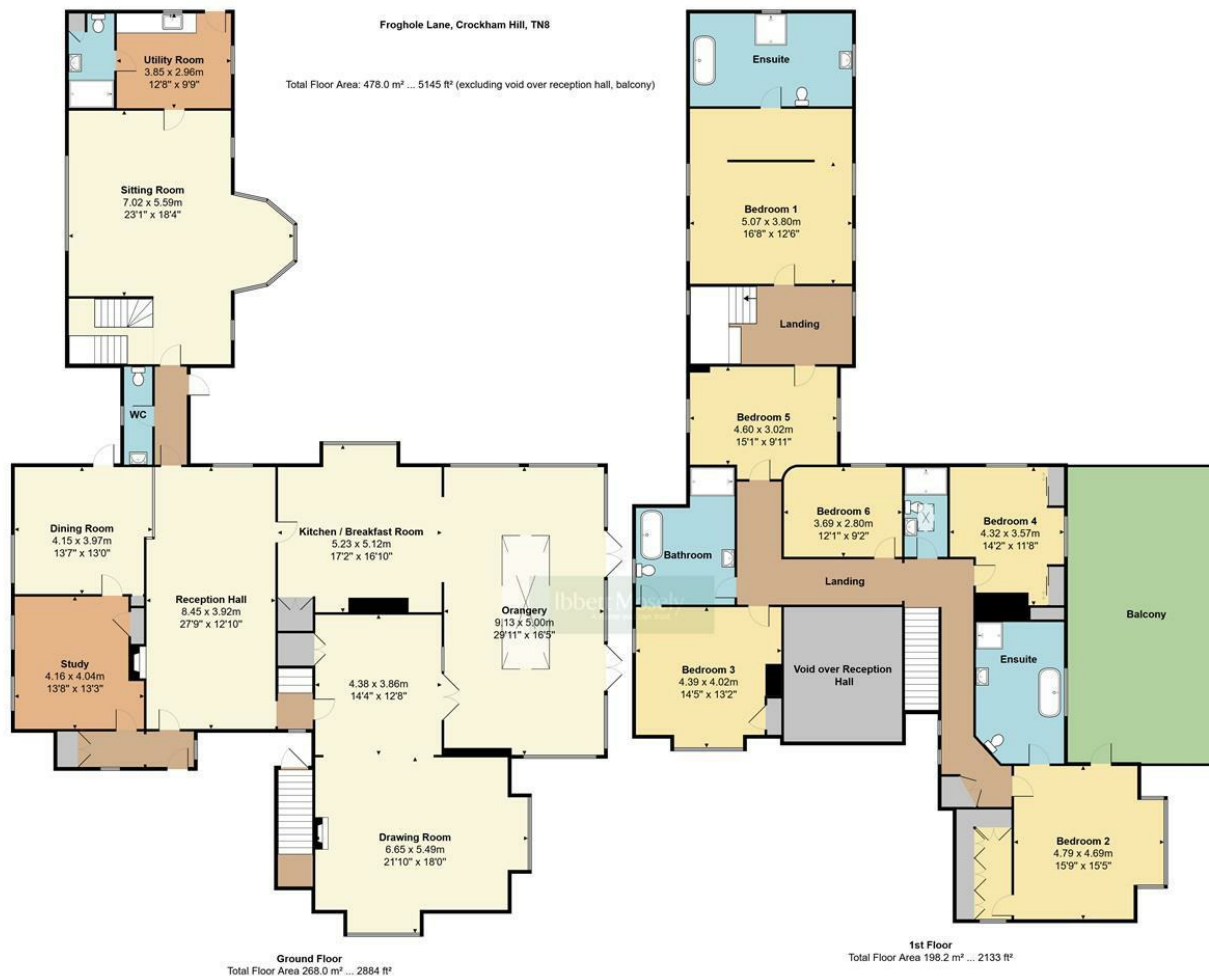
Ground Floor Total Floor Area 268.0 m 2 ... 2884 ft 2