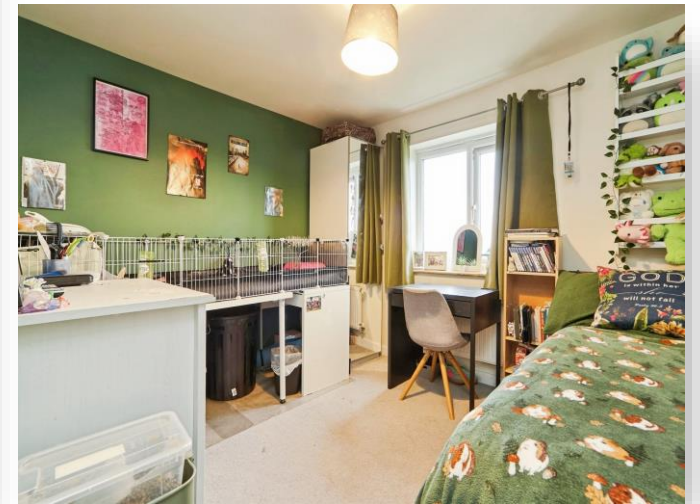
Meadowlands, Allerton Bradford BD15 8HH