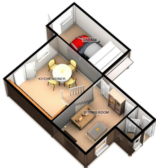
GROUND FLOOR APPROX. FLOOR AREA 515 SQ.FT. (47.9 SQ.M.)