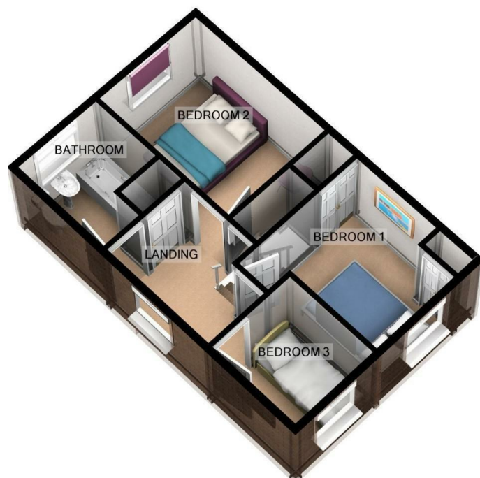
1ST FLOOR APPROX. FLOOR AREA 352 SQ.FT. (32.7 SQ.M.)