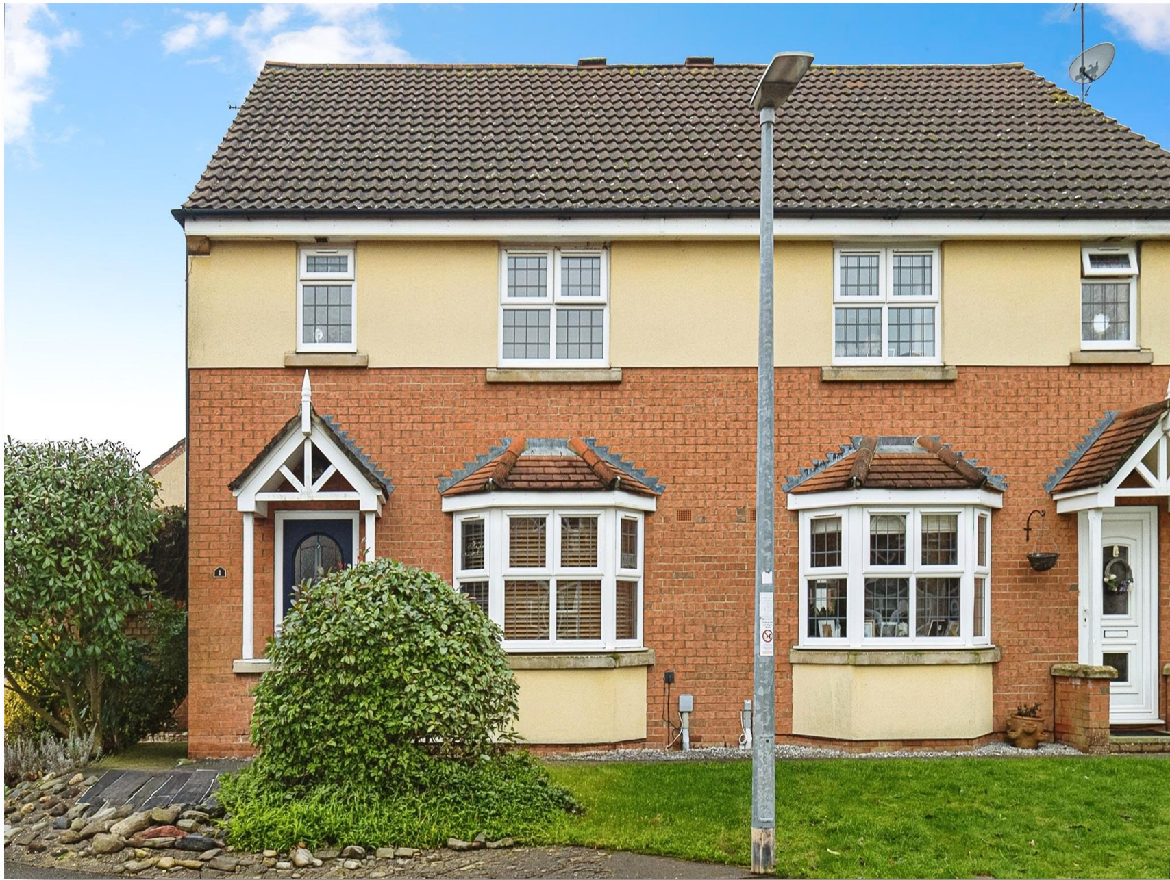
The Bryants, Leven, BEVERLEY, HU17 5QD