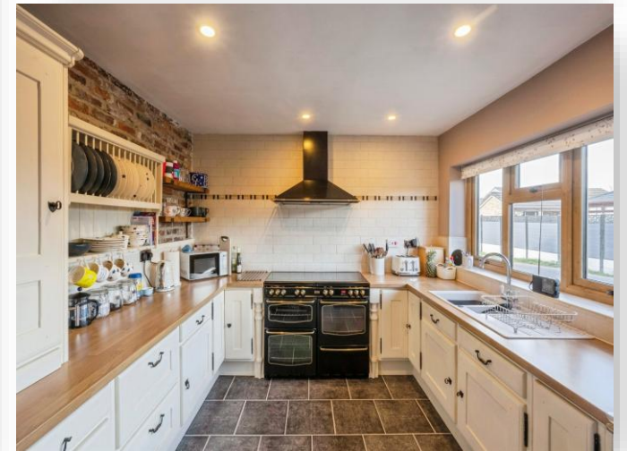
Lane End Mews, Thurnscoe Rotherham S63 0RL